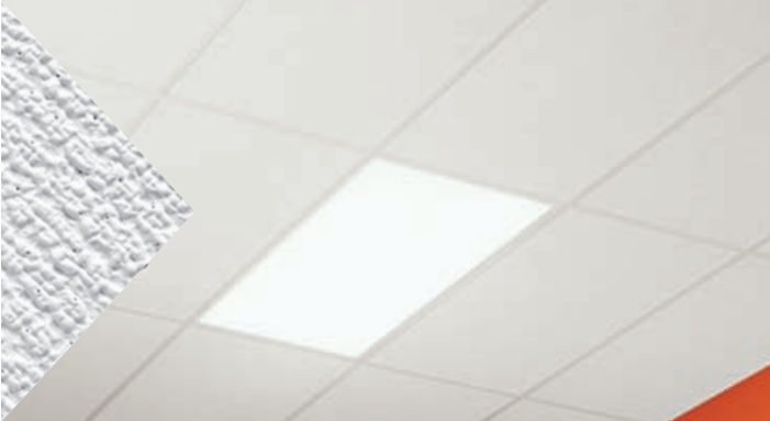
Shasta® panel with Prelude® 15/16" suspension system (Pgs. 391-392)

This economical panel provides sound absorption with a medium-textured, easy-to-clean, durable vinyl surface.